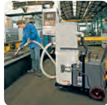
Removal of brass shavings and coolants at a CNC milling station