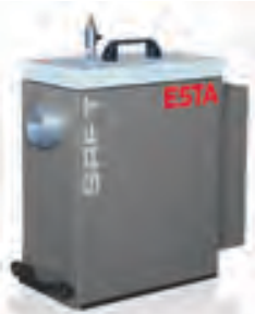
Portable welding fume filter SRF T-2