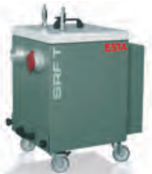
SRF T-4, a mobile device for two extraction points or for connection to pipe systems