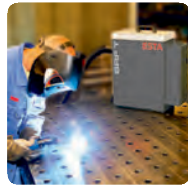
SRF T-2, direct extraction from one welding torch