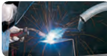
Slotted nozzle. Order Number 94.741