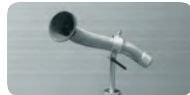
Cone shaped nozzle. Order Number 94.740