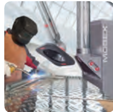
MOBEX F-40 with extraction arm