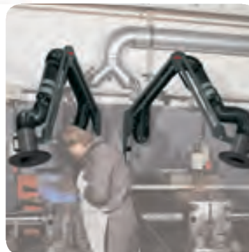
Extraction arm at a welding station