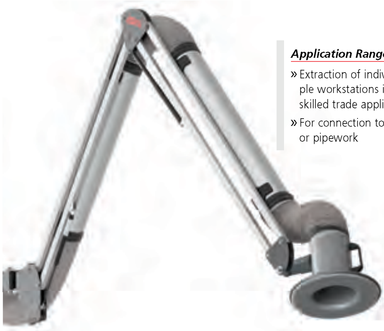
Extraction arm with flanged hood